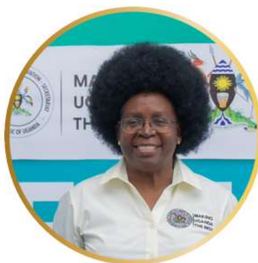
Dr. Monica Musenero Minister for Science, Technology and Innovation.