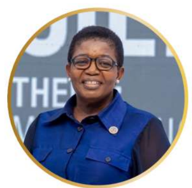
Justine Kasule Lumumba Minister, Office of the Prime Minister (General Duties)