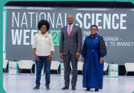
NSW'25 attracted over 100 Venture Capitalists