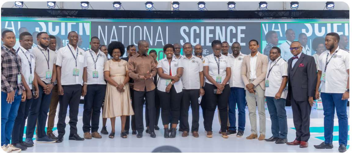
20 th June 2025 - Deputy Speaker Rt. Hon. Thomas Tayebwa poses for a group picture with STI staff.